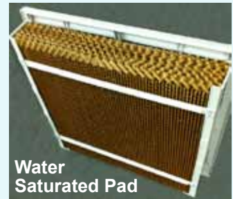
Water Saturated Pad