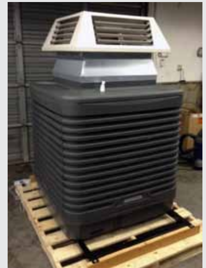
Finished HC-250 with ceiling hung mounting bracket frame attached to bottom of base unit. Shown in Upflow Design with Quad Diffuser.

All units include an LCD controller, humidistat/sensor, air flow transition and diffuser, intelligent auto clean, low water protection.