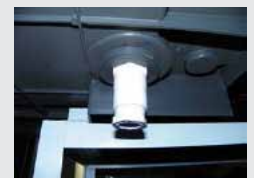
Drain Line Fitting